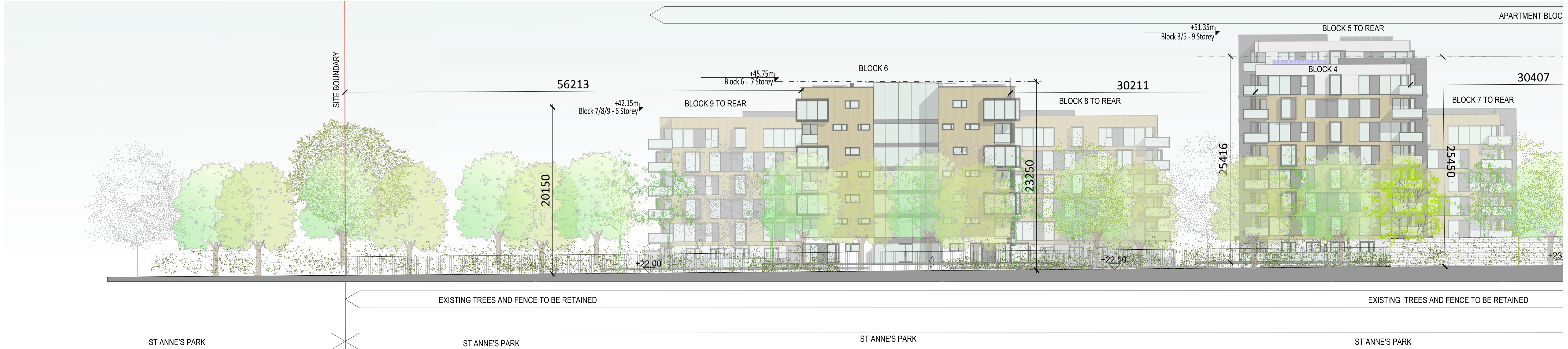
CONTIGUOUS ELEVATION CC 1/250 : NORTHERN BOUNDARY TO SAINT ANNES PARK